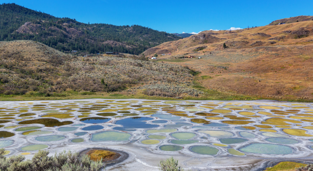
Lake Kliluk, Osoyoos

Make a territory acknowledgement primarily about yourself. It is great to have empathy and self-awareness, but there is a fine line between demonstrating what a territory acknowledgement means to you, and making a territory acknowledgement about yourself. At times, being outwardly emotional about historical and ongoing colonialism places an additional burden on First Nations participants by asking for their emotional labour to support you, which undermines the intent of acknowledging traditional territory.