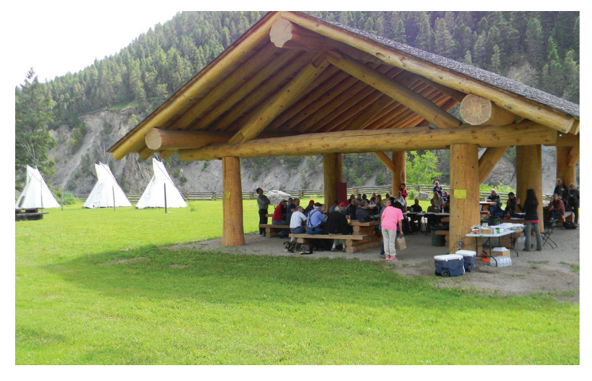
The Xat'sull people have invested in their Heritage Village

in their Heritage Village on the edge of the Fraser River, a site that has been central in their lives for generations. Guests are invited to educational and interactive tours and workshops that showcase the Xat'sull's cultural, spiritual and traditional way of life. Traditional pit house or teepee accommodations, modern washrooms with showers and a large log covered picnic area, made from community forest wood, add to the visitor experience. With improved infrastructure, tourism increases.