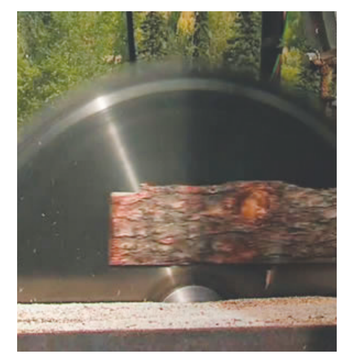
Head rigger saw

To encourage local value added manufacturing, 25 % of the logs harvested on the LXCF are made available to small local businesses. The policy motivated a family with a head rig sawmill to relocate to Likely from Salmon Arm. The head rig is the saw that makes the initial cuts in a round log, turning it into square sided cants, or planks, of wood. Hood and Alf Hilary negotiated an agreement for long term log supply and purchase of the logs from the community forest at fair market value. Hillary started using a low value, reject house log and getting high value by turning them into one inch boards to be dried for flooring for sale in the Yukon. He continues to mill community forest logs for the timber frame market.