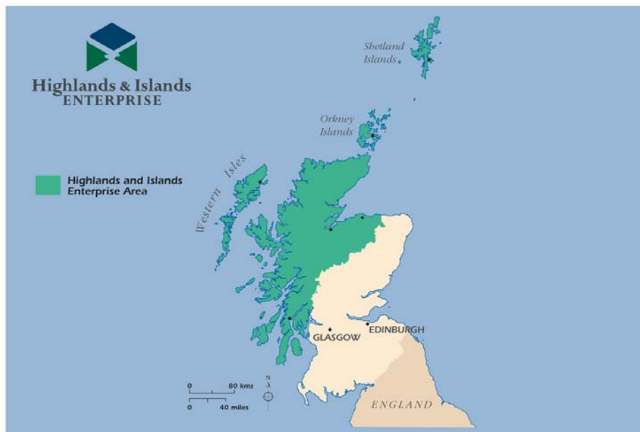
Figure 2.2: Highlands & Islands Enterprise Area

The growth rate here for the last five-year period was 1.5% more than double the rate of growth for Scotland (0.6%). The Highlands and Islands have an older population than Scotland, with a trend